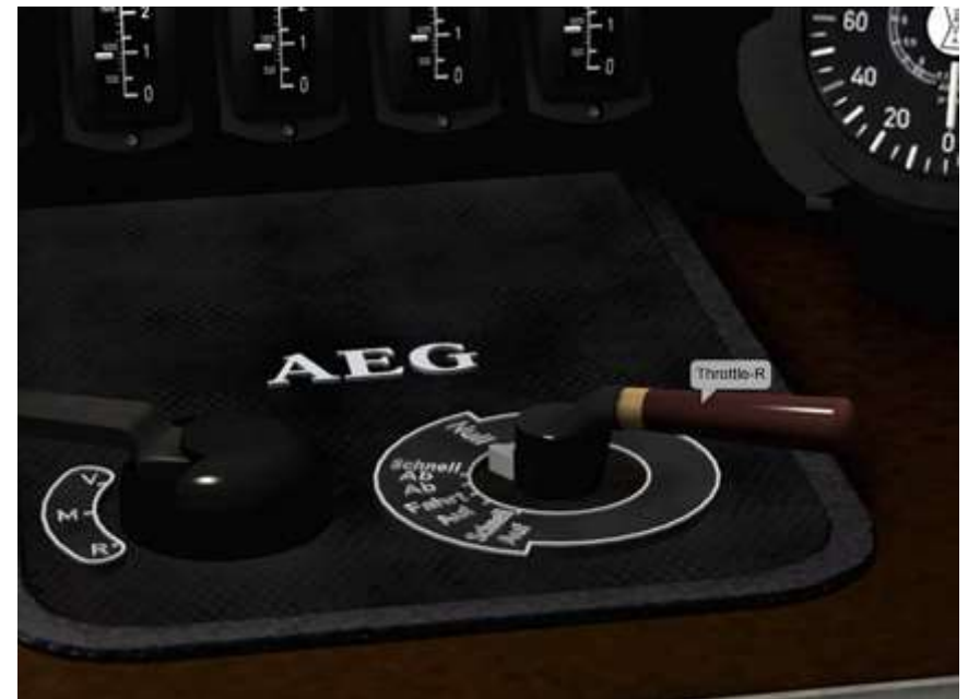
E.g. tip text "Throttle-R"

14 Compressor selector lever - only in the front cab with animation